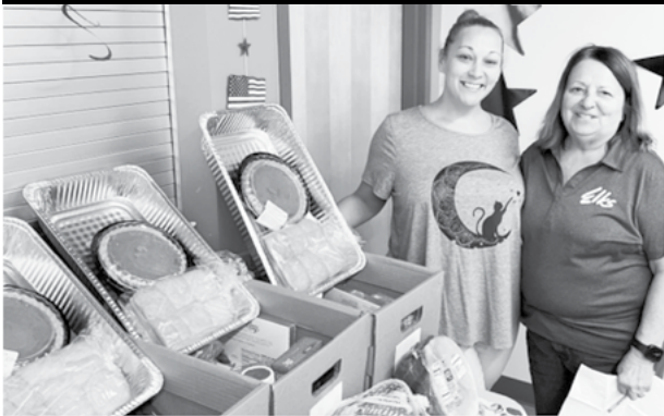
Elgin #737 delivered 31 Thanksgiving dinners to veterans and their families at the 65th Infantry Regiment Borinqueneers in Chicago. Meals were funded with the Focus Grant.