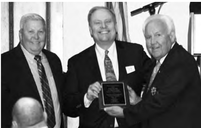
Per Capita 50-500 Members - Bellville #481