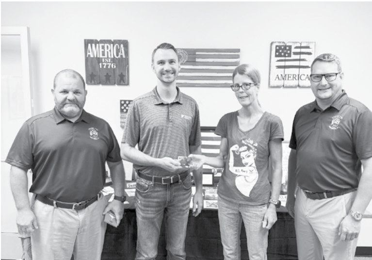
Watseka #1791 gave the 2025 State Veterans Grant of $1000 to the Veterans Assistance Commission of Iroquois County to purchase gas and grocery gift cards.