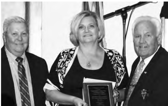
Gross Donations & Per Capita 901+ Members - Springfield #158