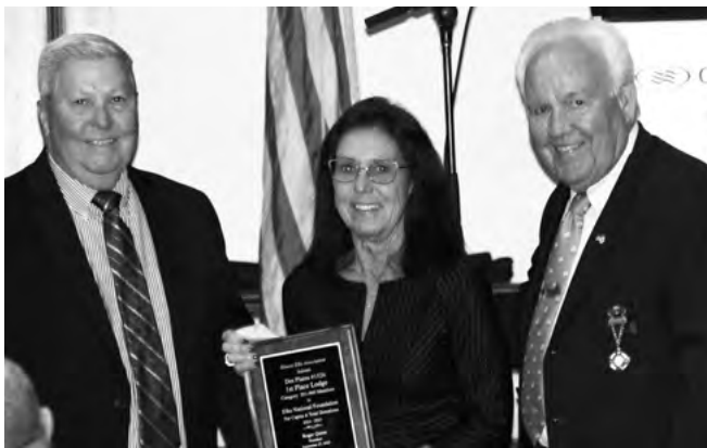
Gross Donations & Per Capita 501-900 members - Des Plaines #1526