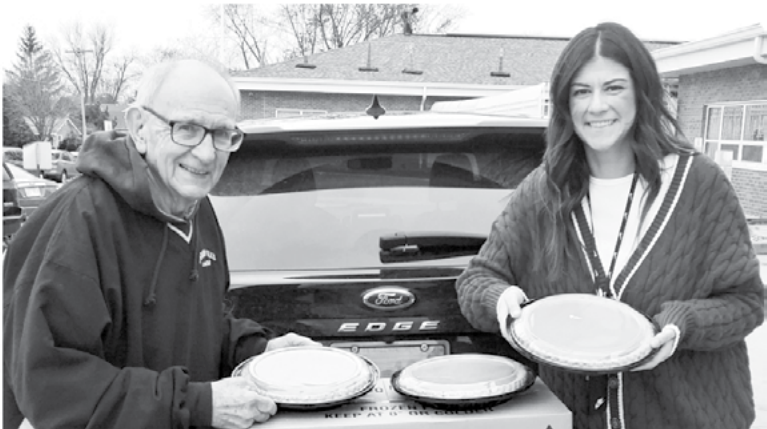
Oglesby #2360 delivered 15 pumpkin pies to the LaSalle Veterans Home for the Veterans 2025 Thanksgiving meal. They used their Freedom Grant and Lodge Bingo profits to fund.