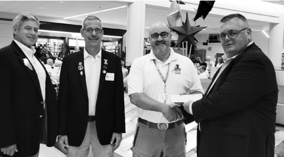
Chicago Honor Flight

Check out the Honor Flights that IEA donated to this year!