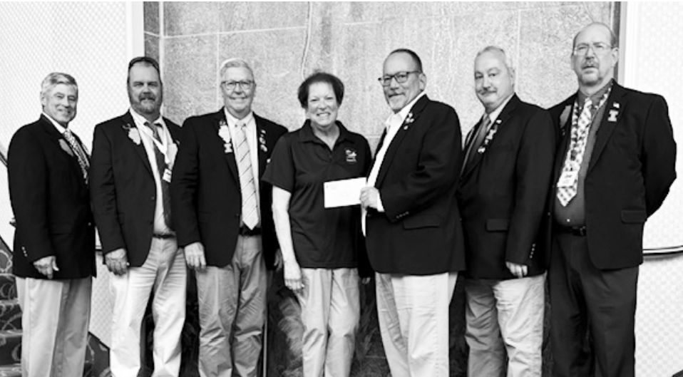
Land of Lincoln Honor Flight: Presented by IEA State Officers