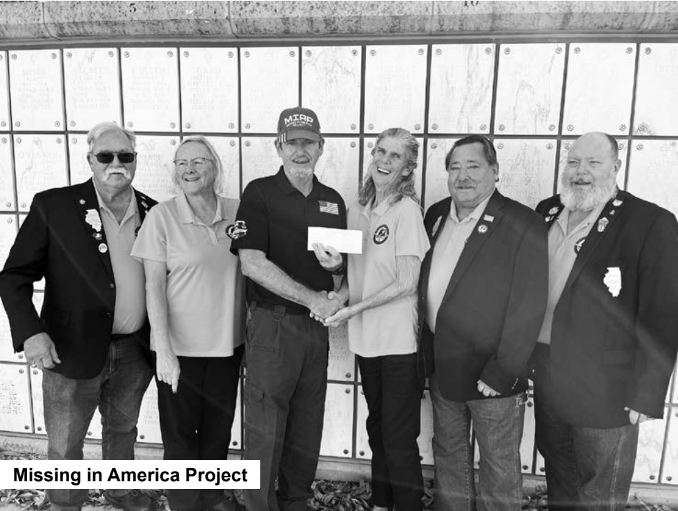
Missing in America Project

MIAP searches funeral homes and crematory's for unclaimed remains. They DNA test to see if any are Veterans. If so, they buy an urn and transport to family if possible. If not, they provide a final resting place with dignity. To date they have recovered 30,951 remains. Of those 6,625 are Veterans. They have interred 6,274 Veterans. To learn more about Missing in America Project visit www.miap.us .