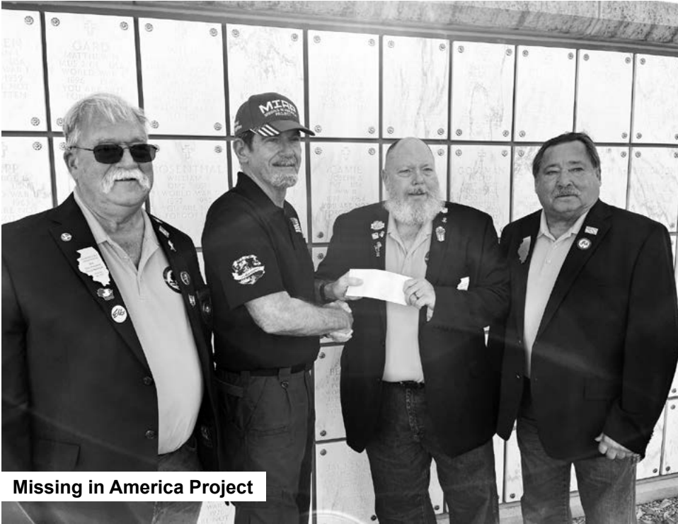
Missing in America Project