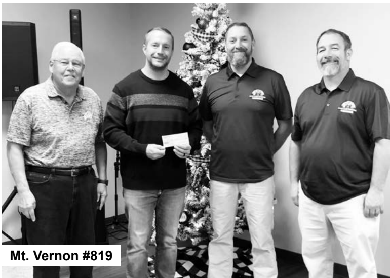
Mt. Vernon #819