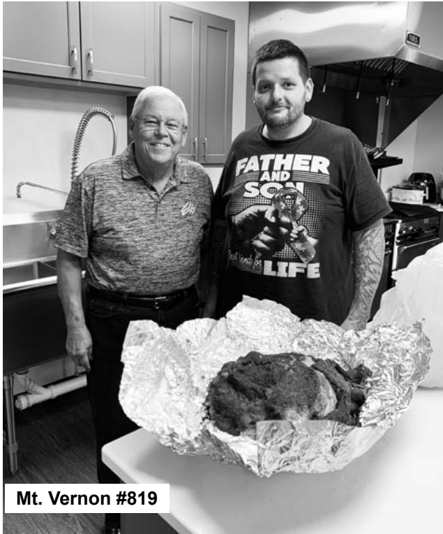
Mt. Vernon #819

Submit your articles and photos to... ilelksnewsette@gmail.com