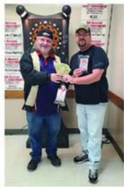
3rd Place Cotton & Chicken Strip

This year's 28th Annual C.C.C. Dart Tournament garnered a net total of $11,139.88 for the state major project of the Illinois Elks Association. While this long-running fundraiser, of the Murphysboro Lodge, depends on a variety of incomes, including raffles, live auction, and a silent auction, much of the income is a result of community businesses, individuals, and Elk members purchasing the SPONSOR BOARDS that are displayed alongside the Dart Machines being used the day of event, and also later listed in the Lodge Newsletter. This year, some 60 Boards were purchased - bringing in $6,000. for Children's Care programs! It is noticeable that the Business Community, in and around Murphysboro, has come to recognize the C. C. C. as a great entity to HELP CHILDREN, and readily open their checkbooks!