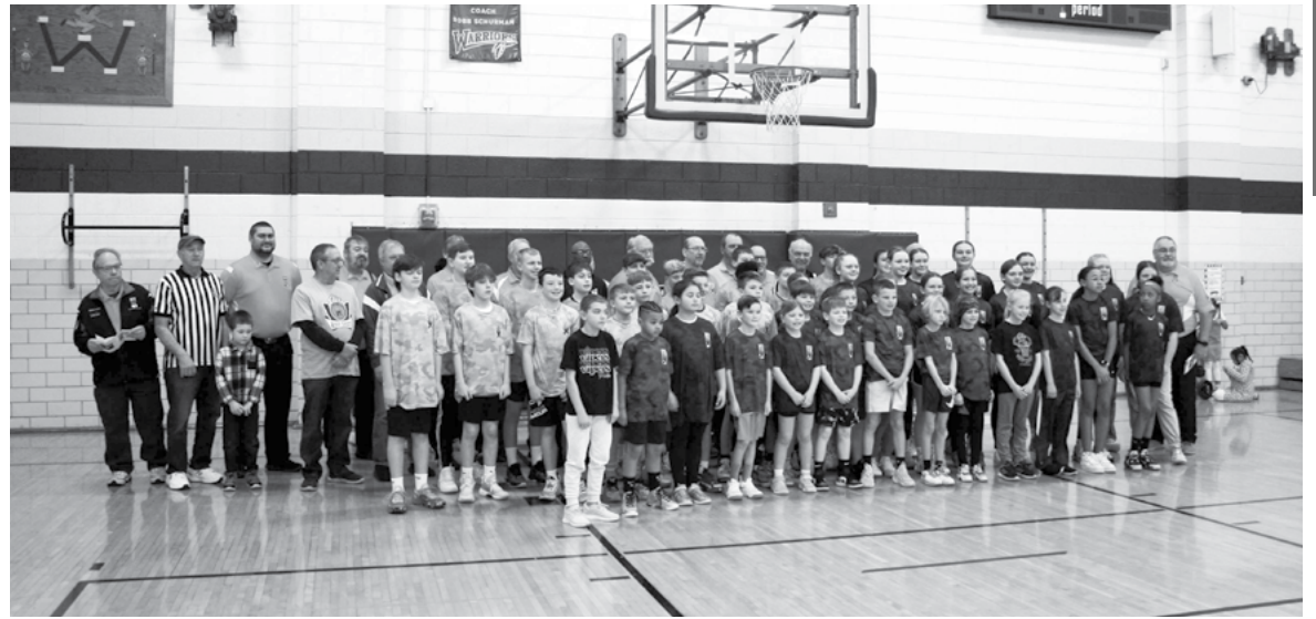
Pictured above is all of our great IL Hoop Shoot participants and the Elks that kept things running!