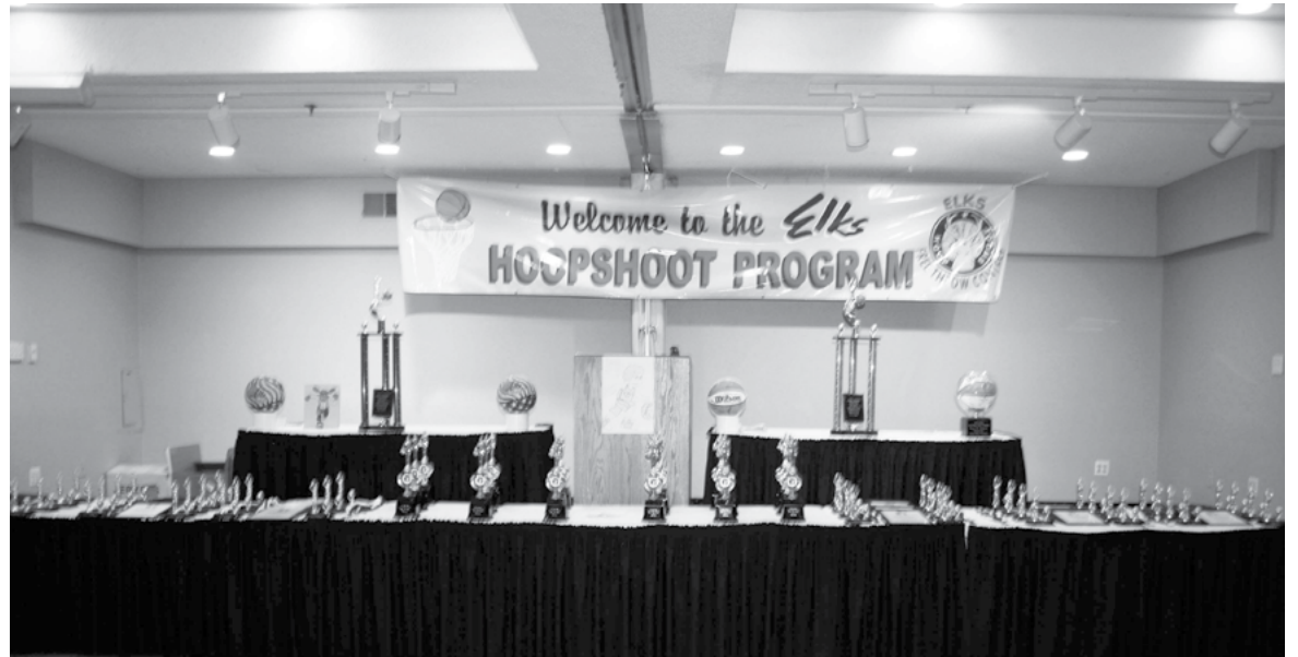
Pictured above is the spread of medals and trophies.