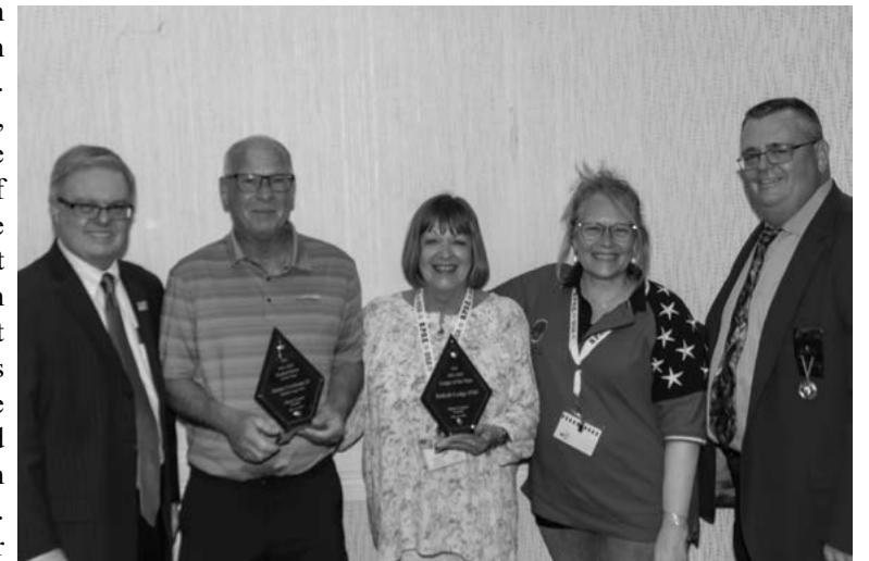
DeKalb #765 Lodge of the Year