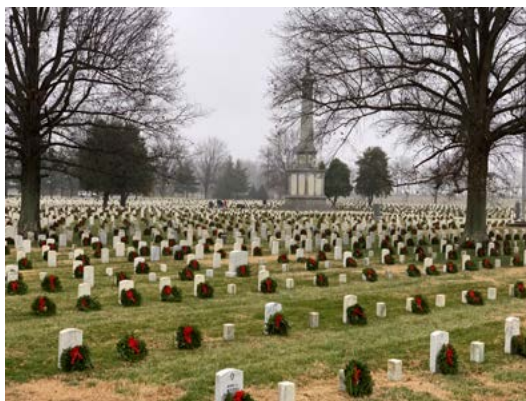
Honor Wreaths on display

On January 8, 2021, the Illinois Elks Association donated $3,500