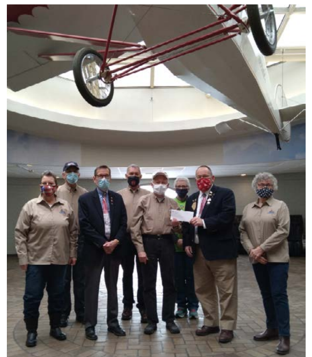
Elks present Quad Cities Team with check.

For more information and applications visit our web site at www.honorflightqc.org .