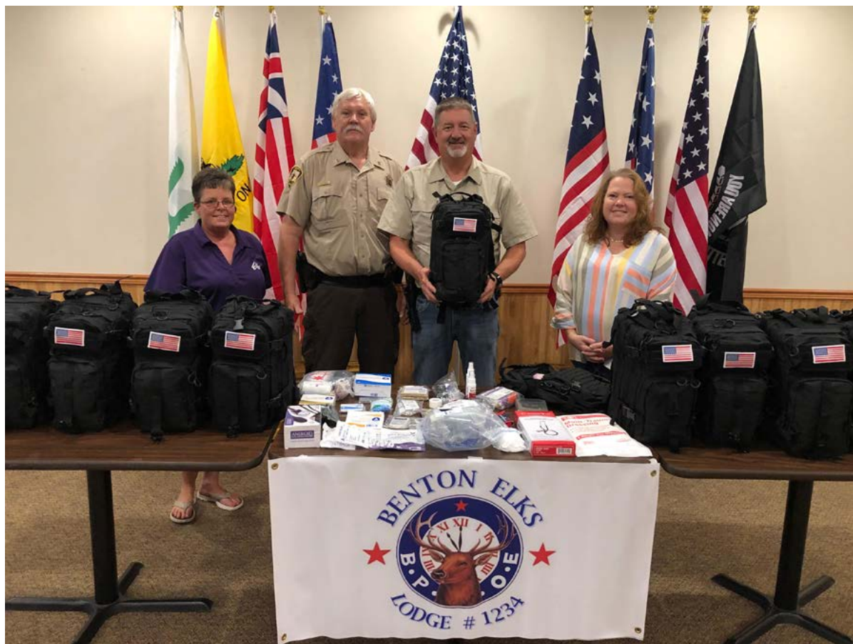
Benton Elks #1234 presented first aid kits to the Franklin County Sheriff's department to be put in department cars. The Lodge received a $2000 Gratitude Grant from the Elks National Foundation.