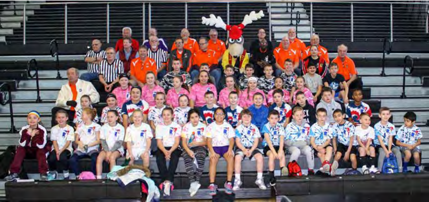
The roster for the 2019-20 IEA Hoop Shoot was stacked! Pictured above are all of the competitors, Elks in attendance and everyone's favorite mascot! A great time was truly had by all in attendance! The turnout was great at the host school, Decatur's Eisenhower High School. The awards ceremony was held after at the Decatur Conference Center and Hotel. Check out winners on next page!