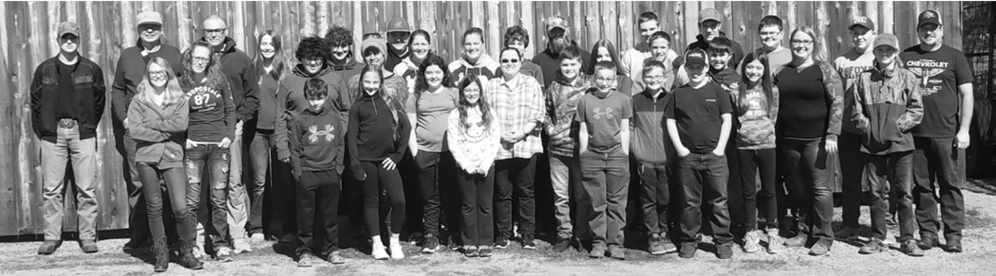
The Illinois Hunters Safety Course was held on February 28 and 29 for both youths and adults. A great turnout pictured above!