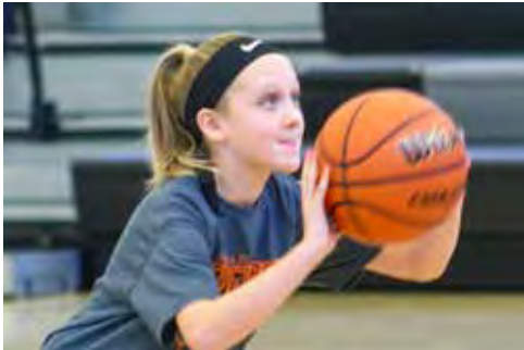
Lining up for the perfect shot!