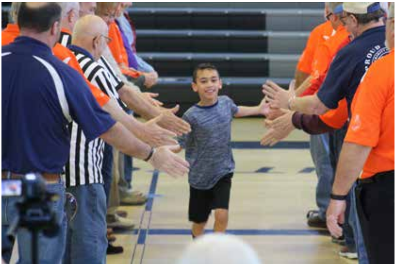
The players ran down center court after being announced and hi-fived Elks along the way!