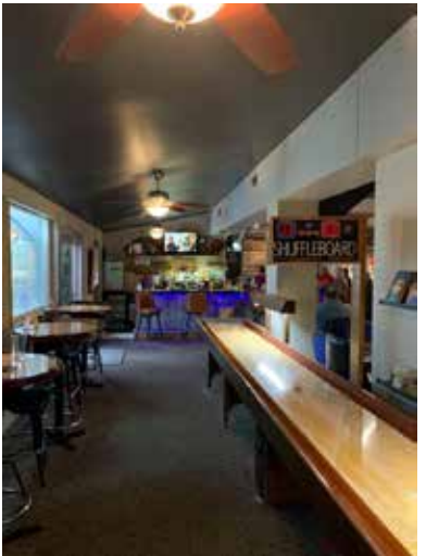
A few photos from inside and outside the Scottsdale 2148 Lodge.