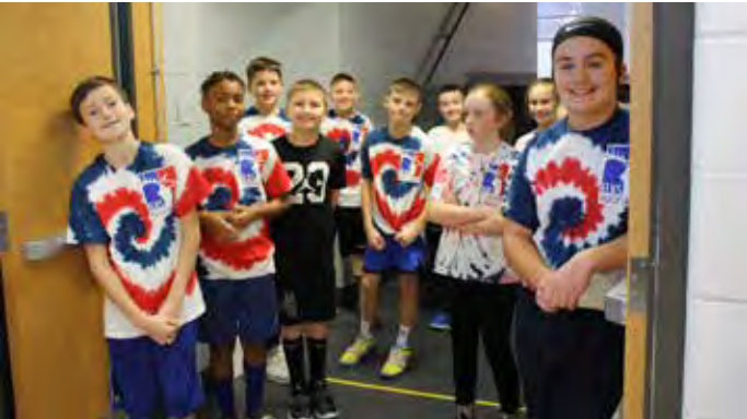
Above: The 10 & 11 year olds anxiously awaiting their chance to shoot! Below: A few familiar faces keep track of scores.

As you all know the Hoop Shoot is over, it's sad but it was a good move to shut it down. As most of our members are over the young age of 60, with all that is going around we do not need to have everyone getting the virus. I want to thank everyone for their outstanding work on trying to have a shoot. A many thanks to the contestants and their parents as well for being involved in a great program. I have received many cards and emails from contestants and their parents thanking the Elks for a great 2-day vacation filled with meeting many new friends and a fun filled weekend! Our 6 winners will get their warm-ups I hope sometime next month; each warm-up will come with their names and Lodge name and the Drug Awareness boy. So they can proudly wear and show off that their number 1 in Elks Hoop Shoot.