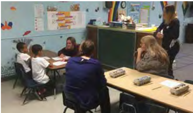
Pictured above and below: tutoring sessions in action.