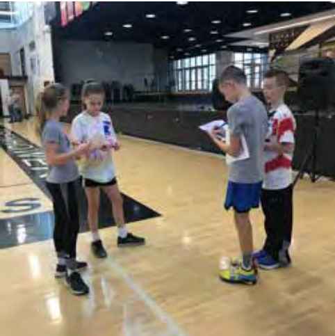
Above: Players exchanging autographs. Below: Shooter perfecting his pre-shot routine.