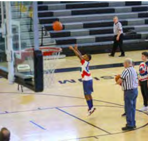
Shooting with style!