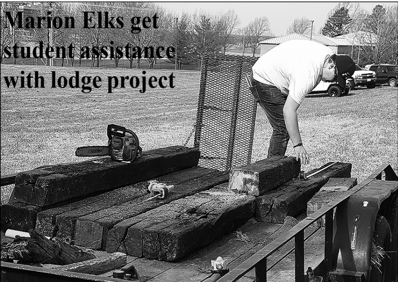
Marion Elks get student assistance with lodge project