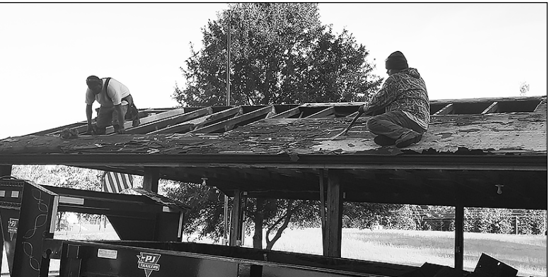
Marion Lodge 800 members work with volunteers from John A Logan Community College to repair pavilions at the lodge’s Lake of Egypt property.