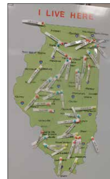
IEA Hoop Shoot finalists pinned their hometowns on a board at the headquarters hotel, demonstrating that the event is indeed statewide.