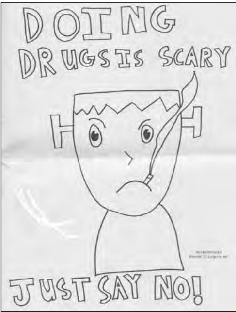
The IEA Drug Awareness Committee arranged for an Elks DAP Coloring Book to be part of the table arrangements at the dinner highlighting the IEA Mid-Winter Meeting. The coloring book included the design of Ben Hopfinger, representing Belleville Lodge 481.

The IEA collected more than 36,800 pounds of unused or unwanted pills for disposal on Oct. 27 during the National Drug Take Back Day. Those 36,800 pounds of pills add to the now total of more than 518,000 pounds collected from the 16 take-back programs held in Illinois over the years. The Center for Disease control reported a 16.8 percent increase in overdose deaths in Illinois in 2018, which translates into a total of 2,900 overdose deaths reported last year. Burr said those 2,900 deaths are actually understated due to incomplete reporting. Illinois' 16.8 percent increase in overdose deaths contrasts with the 1 percent decrease nationally. The next Take-Back Day is scheduled April 27. At the Mid-Winter meeting, the IEA Drug Awareness Committee emphasized the continuing need to grow the Drug Awareness Program in every lodge "to stay ahead of the game and to help Illinois youth," Chairman Frank Burr said in his committee report. Also discussed were the new drug-related laws and how to promote the Elks Drug Awareness Program.