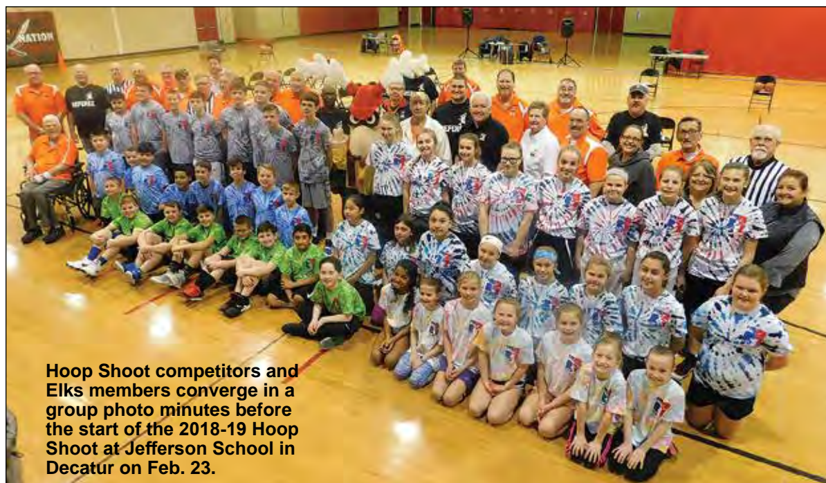
Hoop Shoot competitors and Elks members converge in a group photo minutes before the start of the 2018-19 Hoop Shoot at Jefferson School in Decatur on Feb. 23.