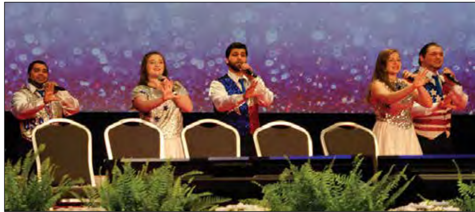
Re-Creation performs ahead of The Lieutenant Dan Band. The group, which entertains veterans organizations nationwide, receives support from the IEA.