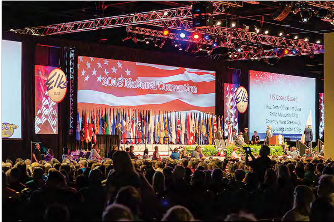
The stage is set for the open of the 2018 Grand Lodge Convention in San Antonio.