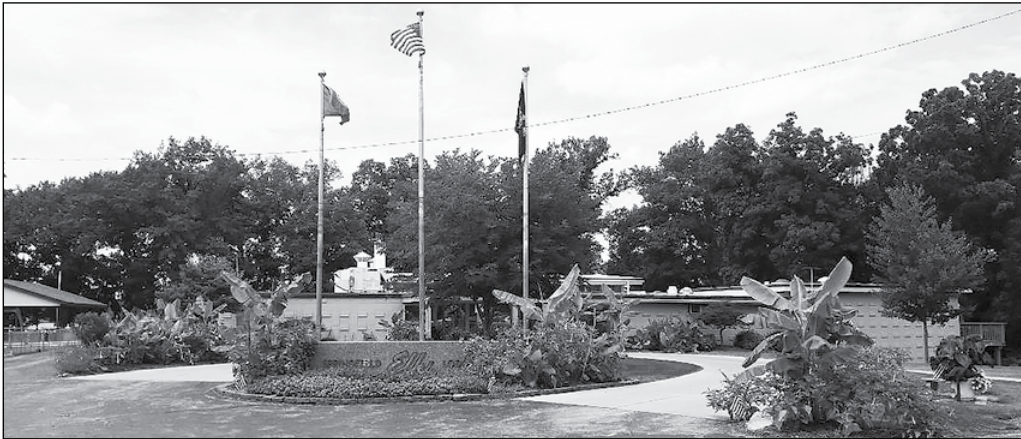
The ladies lunch will be at Springfield Lodge, nestled in a garden setting overlooking Lake Springfield.