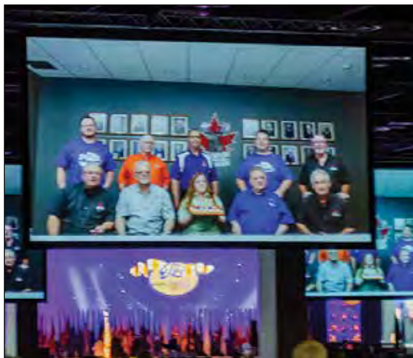
Canadian Elks give their congratulations to the BPOE for reaching its 150th year of service.