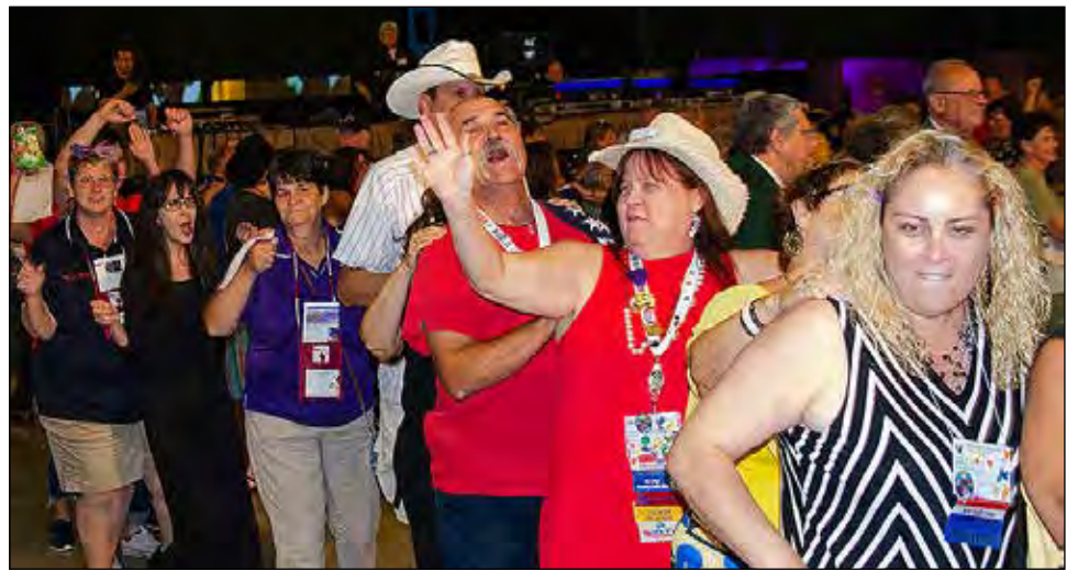
Convention attendees form a conga line to feel the beat of The Lieutenant Dan Band performance.