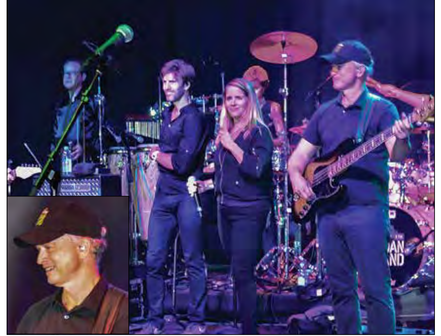
"The Lieutenant Dan Band," led by actor Gary Sinise of Forrest Gump fame, put on a memorable 90-minute concert to help open the convention.