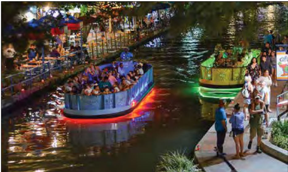
The San Antonio River Walk contributed to the ambiance of the BPOE's 150th anniversary celebration.