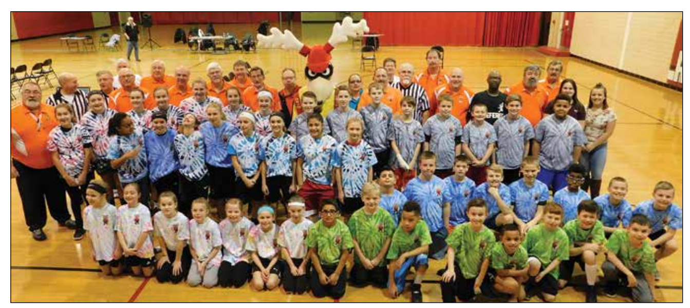
THE COMPETITORS and IEA officials and helpers, before the start of the 2017-18 IEA Hoop Shoot.