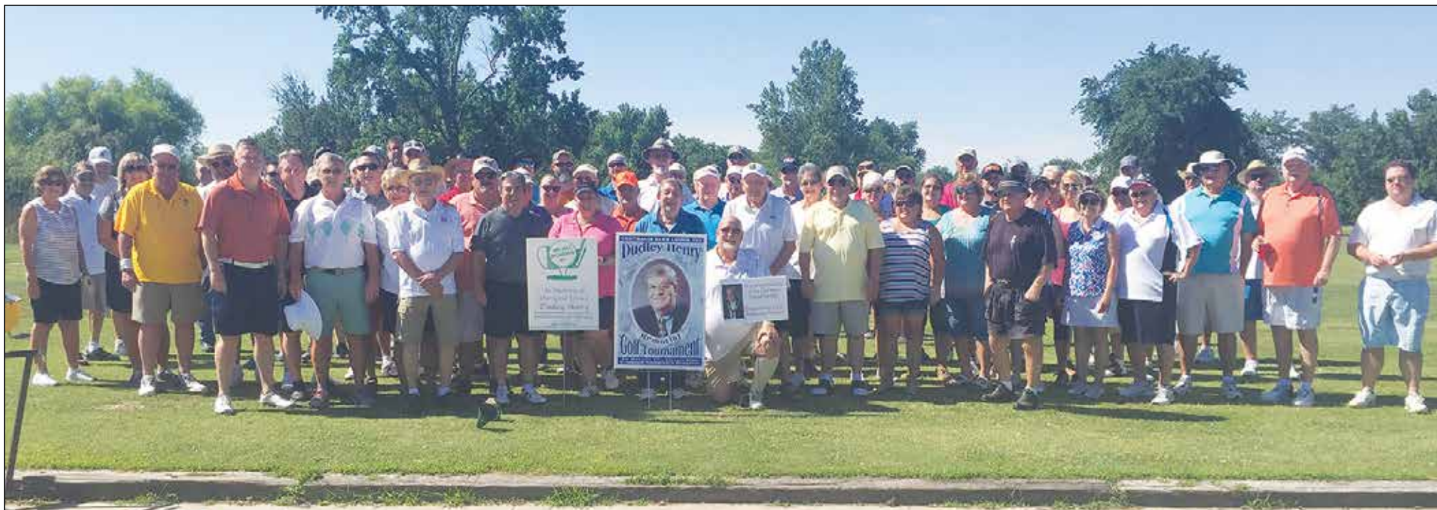
Centralia Lodge 493 recently held its annual Dudley Henry Memorial Golf Tournament, raising $2,500 for the Children's Care Corporation.