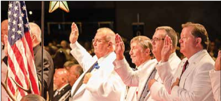
Grand Lodge officers take the oath of office for 2017-18.