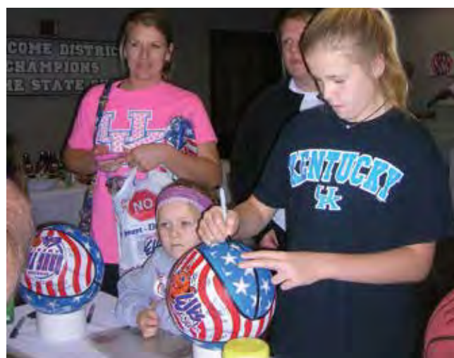
Hoop Shoot finalist signs one of the basketballs that were given to the participants who secured the greatest number of signatures of Elks members attending this year's event in Decatur.