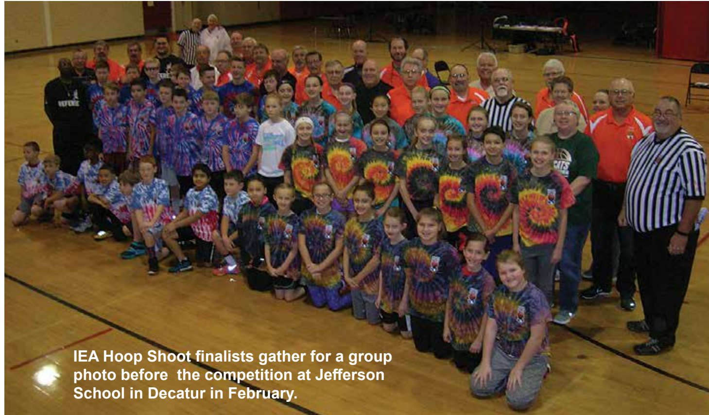
IEA Hoop Shoot finalists gather for a group photo before the competition at Jefferson School in Decatur in February.

In addition, Illinois' shooters overall sank more shots than their counterparts in Iowa, Minnesota and Wisconsin with 120 shots made in regulation, compared to Wisconsin's 117, Minnesota's 116 and Iowa's 105.