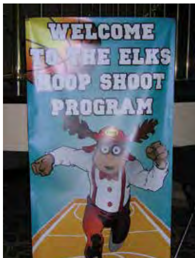
Hoop Shoot participants received a Drug Awareness message in a high-traffic area during registration.